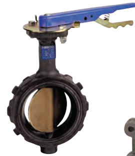
WD-3000 Wafer Style EPDM Liner and Aluminum Bronze Disc