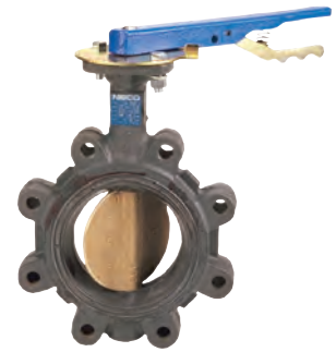
LD-3000 Lug Style EPDM Liner and Aluminum Bronze Disc