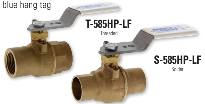
585HP-66-LF with stainless steel trim also available.